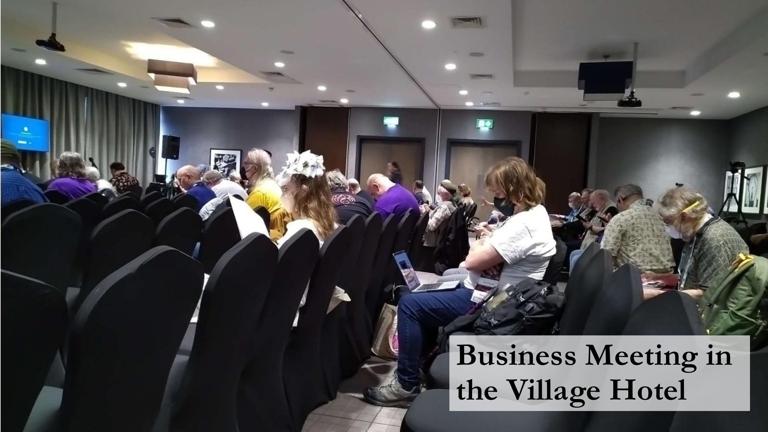
Business Meeting in the Village Hotel