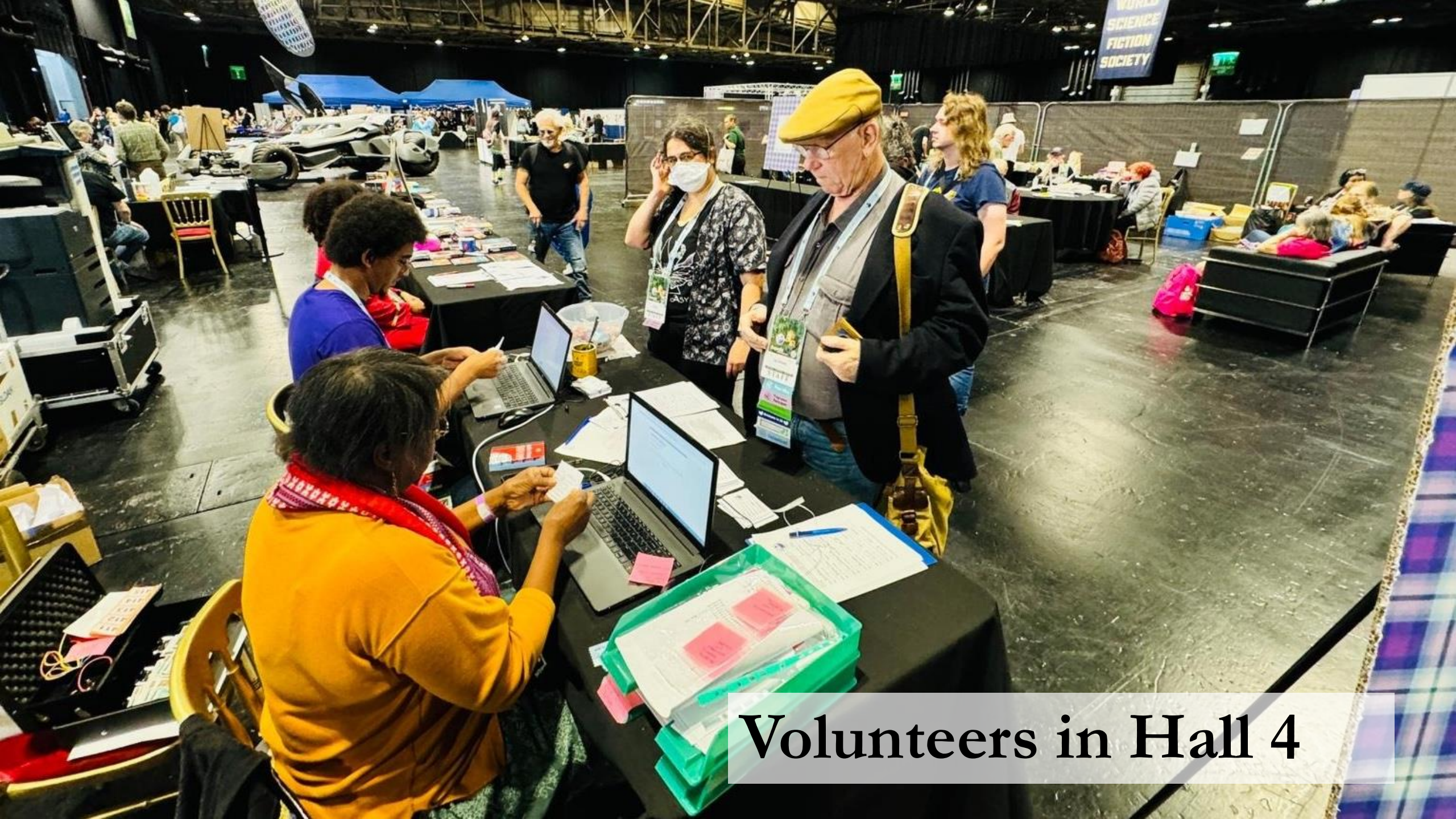
Volunteers in Hall 4