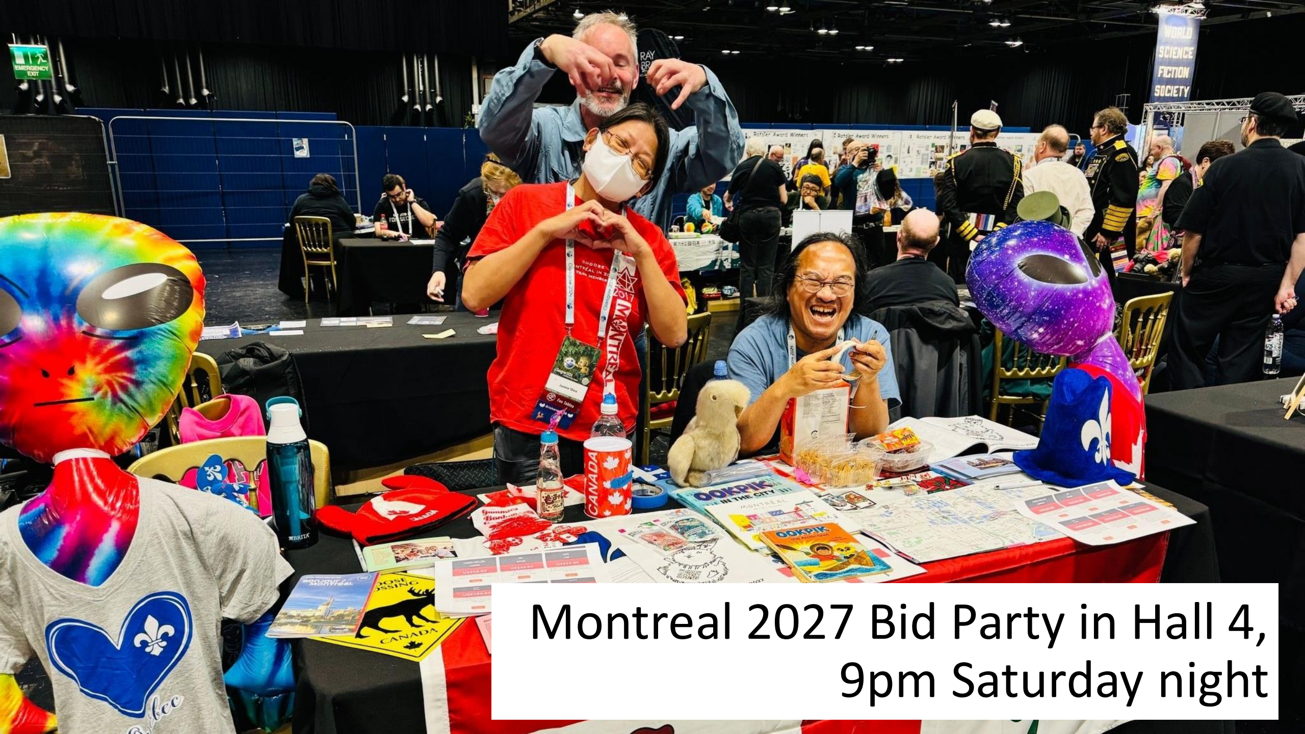
Montreal 2027 Bid Party in Hall 4, 9pm Saturday night