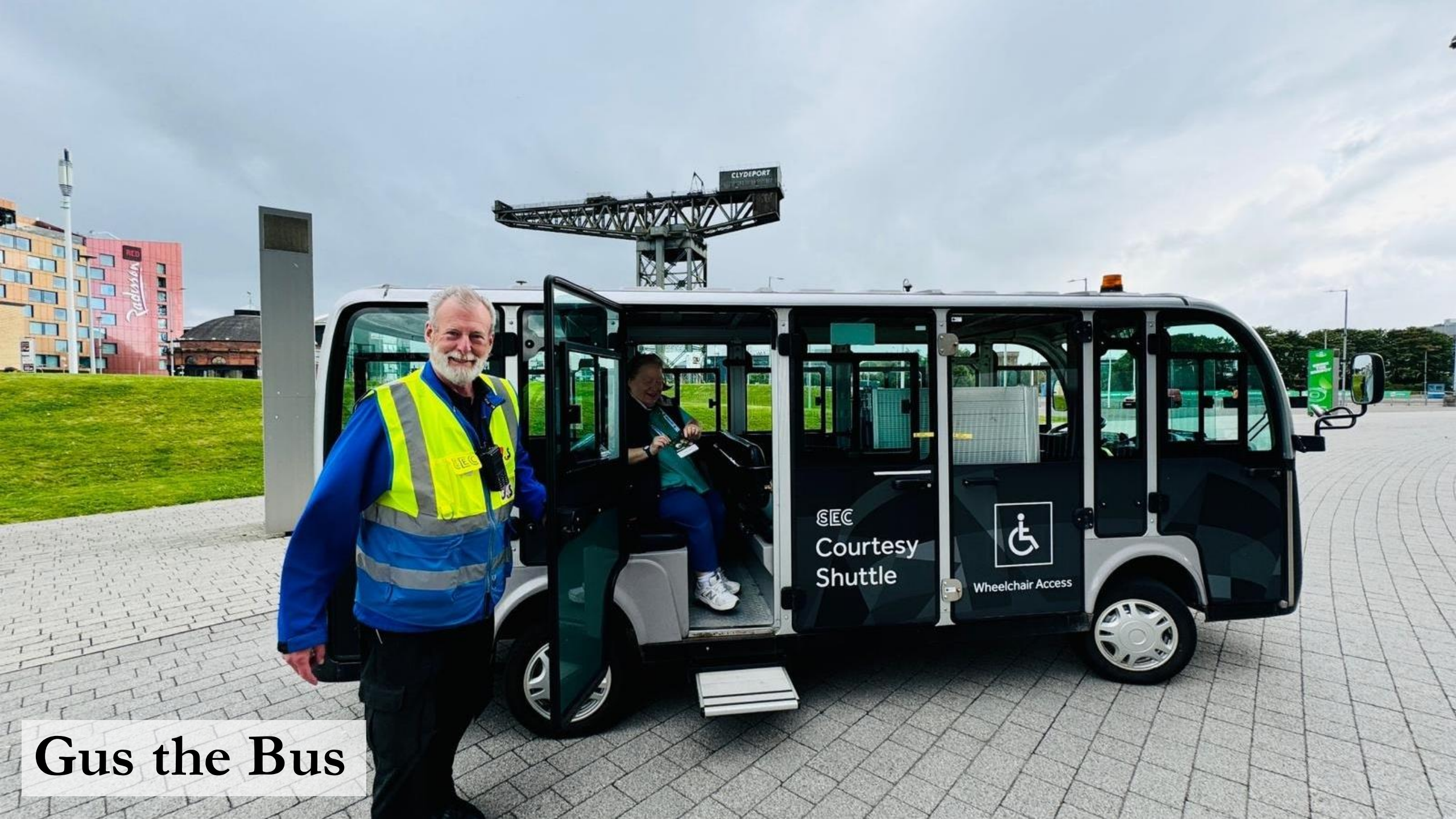
Gus the Bus